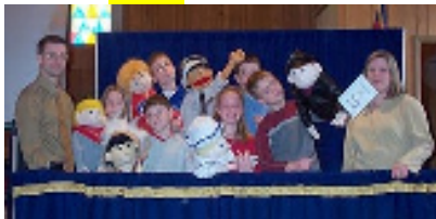
The Holy Puppets

Life at Seelyville UMC is all about community.