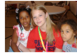
Sharing God's love is what the 14th & Chestnut Community Center is all about

Haute area. The congregation maintains an emergency food pantry and provides assistance to those in need of short-term financial assistance. Nearly