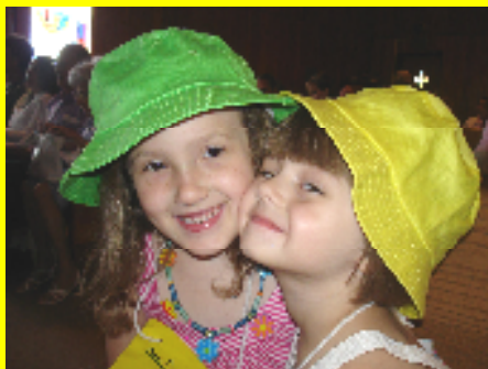
VBS 2008: Making friends at the Beach Party!