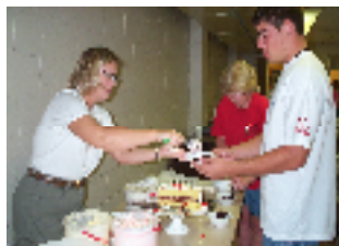
Rose-Hulman students being served fellowship meal

Life in the community of Seelyville UMC means service and growth. All our ministries have at their core the desire to grow spiritually and to reach out in service to others. These ministries include ongoing Bible studies, fellowship groups, service groups, music groups, fellowship dinners for Rose-Hulman students, craft and scrapbooking groups, scouts, and special opportunities that meet once or over a short period.